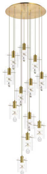
Gold Item No:5202D22G